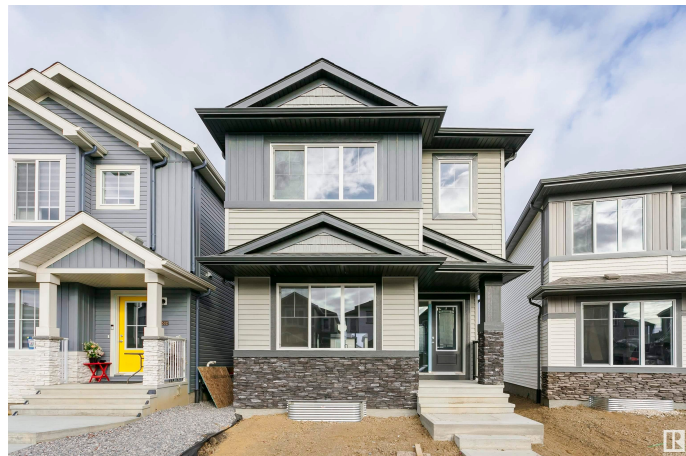
9530 Carson Bend SW, Edmonton, AB

Main Floor Exterior Area 74.32 m 2 Interior Area 68.37 m 2