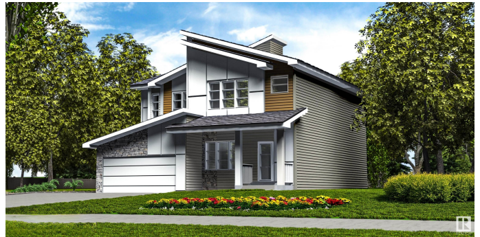
The Deveraux | 1,411 Sq. Ft.

MLS® # E4433250 Price $457,900 Bedrooms 3